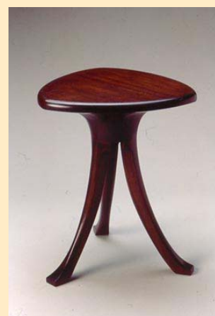
Three legged stool. Mahogany, 18" tall