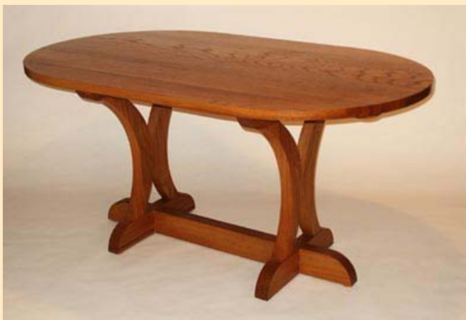
Dining Table. Elm. 60" long x 36" wide x 30" high