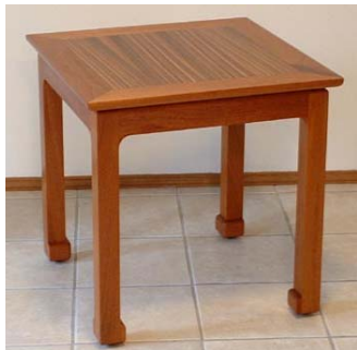
Asian Variation Side Table - Mahogany, Zebrawood, 18 x 18 x 18.