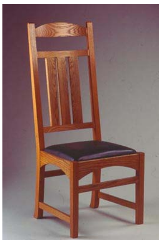
Craftsman Chair - White Oak, Leather, 20 x 20 x 48.