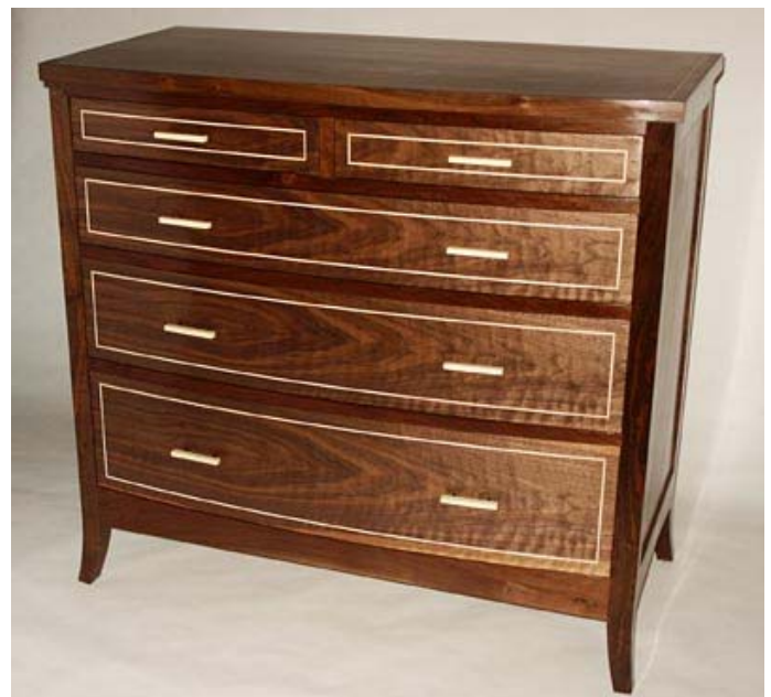
Dresser - Walnut, Holly 45 x 24 x 42. by Geoffrey Wirth

Colorful Kalaidoscopes with Mark Baldwin December 15, 9:30am - 12:30pm or 1:30pm - 4:30pm