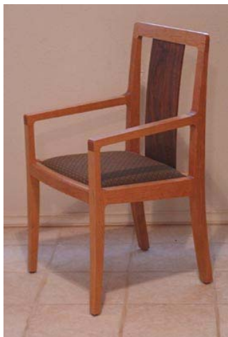
Formline Chair. Cherry, Walnut, Upholstery, 21 x 19 x 36.